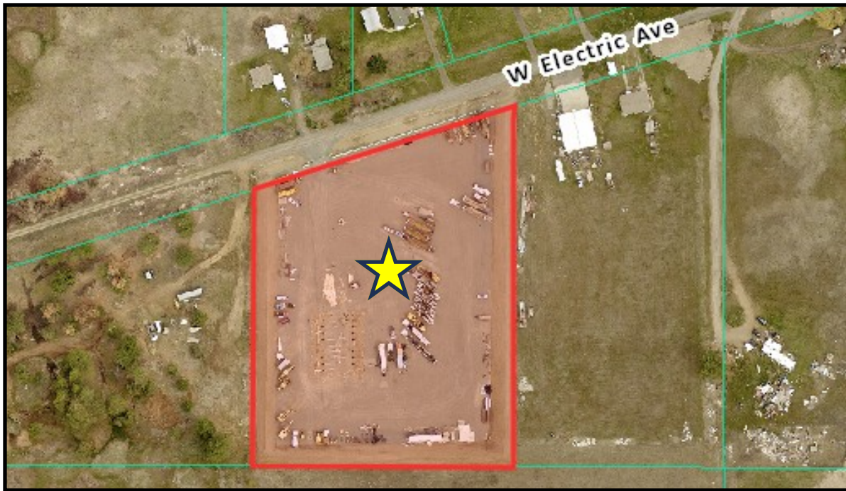
Centrally Located with Easy I-90 Access