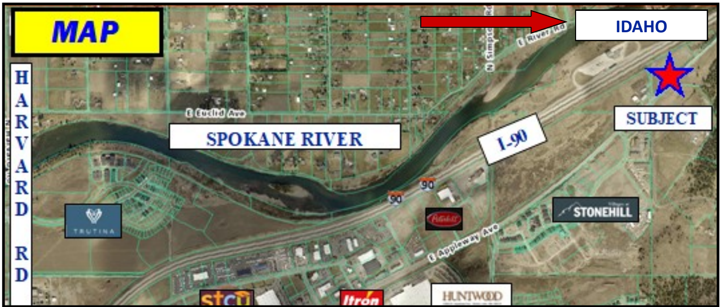
Liberty Lake Freeway Commercial Acreage at State Line